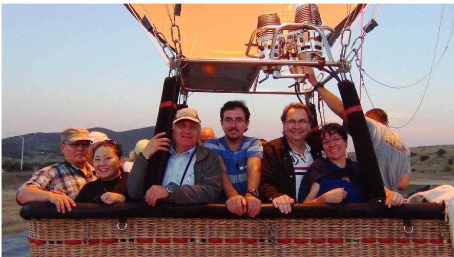
Sunset Hot Air Balloon Flight