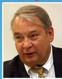
Ferid Murad 1998 - Medicine