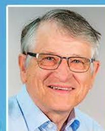
Klaus V. Klitzing 1985 - Physics