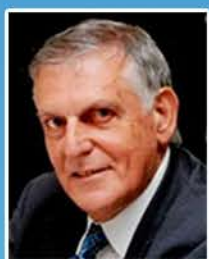
Dan Shechtman 2011 - Chemistry