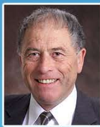
Kurt Wüthrich 2002 - Chemistry