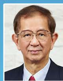
Yuan T. Lee 1986 - Chemistry