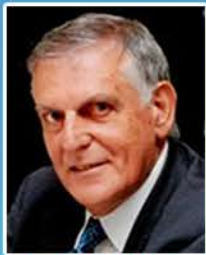
Dan Shechtman 2011 - Chemistry