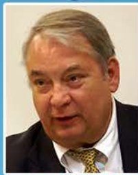
Ferid Murad 1998 - Medicine