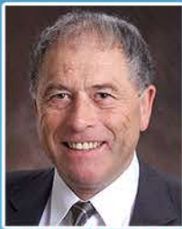
Kurt Wüthrich 2002 - Chemistry