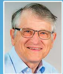
Klaus V. Klitzing 1985 - Physics