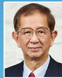
Yuan T. Lee 1986 - Chemistry