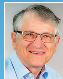
Klaus V. Klitzing 1985-Physics