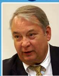
Ferid Murad 1998 - Medicine