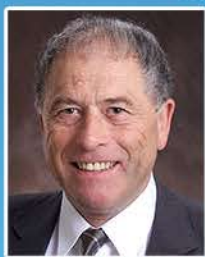
Kurt Wüthrich 2002 - Chemistry