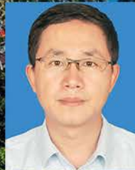
Lang Liu Xi'an Univ.(XUST) China