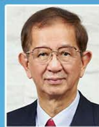
Yuan T. Lee 1986-Chemistry