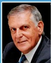
Dan Shechtman 2011 - Chemistry