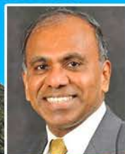
Subra Suresh President, NTU Singapore Former Director NSF, USA