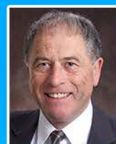
Kurt Wüthrich 2002 - Chemistry