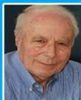
Avram Hershko 2004 - Chemistry