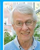
Richard Roberts 1993 - Medicine