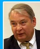
Ferid Murad 1998 - Medicine