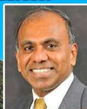
Subra Suresh President, NTU Singapore Former Director NSF, USA