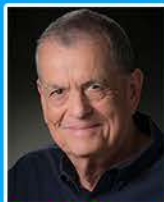
Aaron Ciechanover 2004 - Chemistry