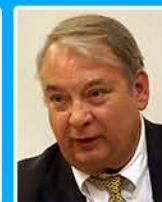
Ferid Murad 1998 - Medicine