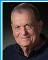
Aaron Ciechanover 2004 - Chemistry