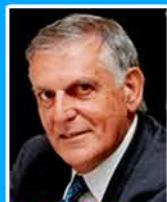
Dan Shechtman 2011 - Chemistry