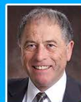
Kurt Wüthrich 2002 - Chemistry