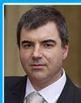
Konstantin Novoselov 2010 - Physics