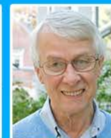
Richard Roberts 1993 - Medicine