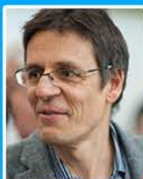
Didier Queloz 2019 - Physics