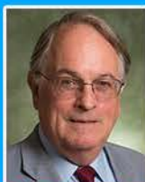
Stanley Whittingham 2019 - Chemistry