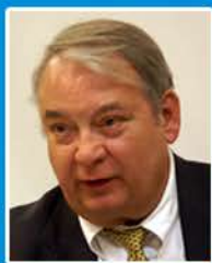
Prof. Ferid Murad

SIPS 2022, in Honor of Nobel Laureate, Prof. Ferid Murad