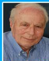
Avram Hershko 2004 - Chemistry