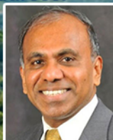
Subra Suresh President, Global Learning Council Switzerland Former Director NSF, USA