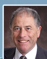
Kurt Wüthrich 2002 - Chemistry