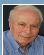
Avram Hershko 2004 - Chemistry