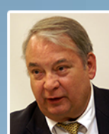
Ferid Murad 1998 - Medicine (Passed away on the 4th of Sept. 2023)