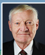
Joachim Frank 2017 - Chemistry