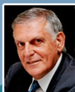
Dan Shechtman 2011 - Chemistry