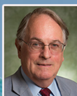
Stanley Whittingham 2019 - Chemistry