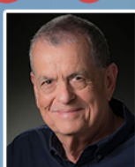
Aaron Ciechanover 2004 - Chemistry