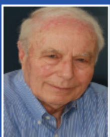
Avram Hershko 2004 - Chemistry