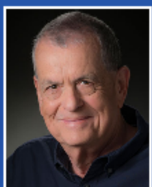
Aaron Ciechanover 2004 - Chemistry