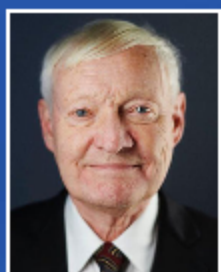
Joachim Frank 2017 - Chemistry