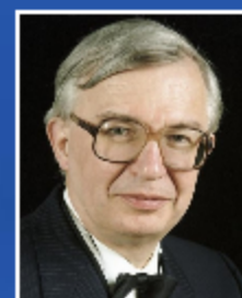
Jean-Marie Lehn 1987 - Chemistry