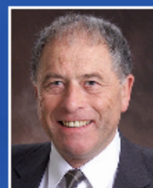
Kurt Wüthrich 2002 - Chemistry