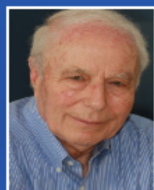
Avram Hershko 2004 - Chemistry