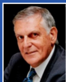
Dan Shechtman 2011 - Chemistry