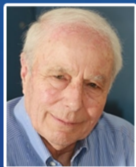
Prof. Avram Hershko

Dedicated to Modern Hellenism & in Honor of Nobel Laureate in Chemistry, Prof. Avram Hershko