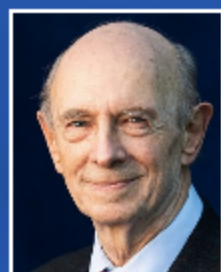
Harvey J. Alter 2020 - Medicine