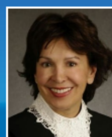
Louise Otis International Judge, Mediator and Arbitrator