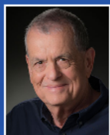
Aaron Ciechanover 2004 - Chemistry