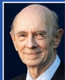
Harvey J. Alter 2020 - Medicine