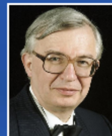
Jean-Marie Lehn 1987 - Chemistry