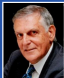
Dan Shechtman 2011 - Chemistry