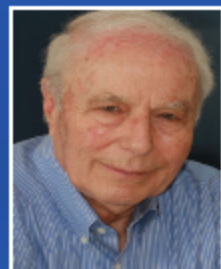
Avram Hershko 2004 - Chemistry