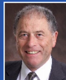
Kurt Wüthrich 2002 - Chemistry