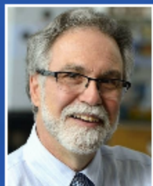
Gregg L. Semenza 2019 - Medicine