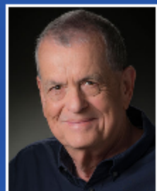
Aaron Ciechanover 2004 - Chemistry