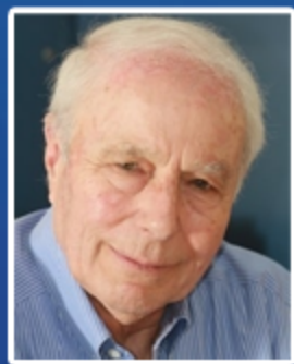
Prof. Avram Hershko

Dedicated to Modern Hellenism & in Honor of Nobel Laureate in Chemistry, Prof. Avram Hershko