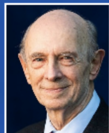
Harvey J. Alter 2020 - Medicine