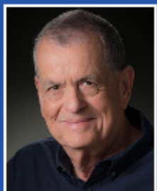
Aaron Ciechanover 2004 - Chemistry