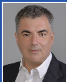
Konstantin Novoselov 2010 - Physics