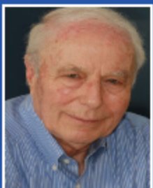
Avram Hershko 2004 - Chemistry