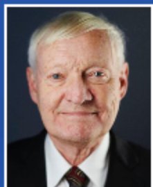
Joachim Frank 2017 - Chemistry