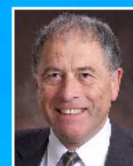
Kurt Wüthrich 2002 - Chemistry