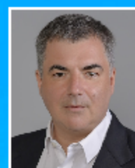
Konstantin Novoselov 2010 - Physics