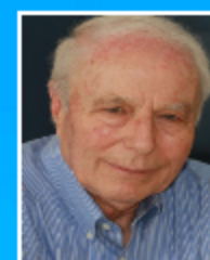
Avram Hershko 2004 - Chemistry