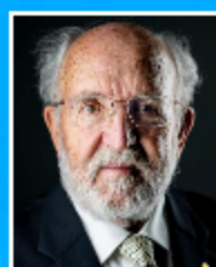
Michel Mayor 2019 - Physics