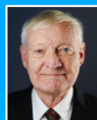
Joachim Frank 2017 - Chemistry