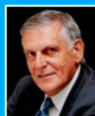
Dan Shechtman 2011 - Chemistry