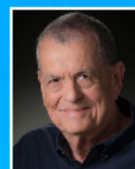
Aaron Ciechanover 2004 - Chemistry