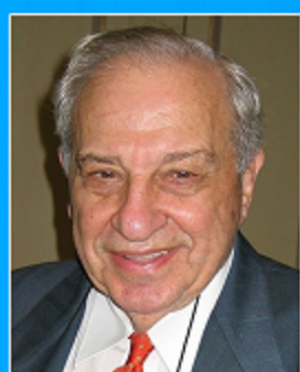
Dr. Rudy Marcus

Dedicated in Honor of Nobel Laureate in Chemistry, Prof. Rudy Marcus