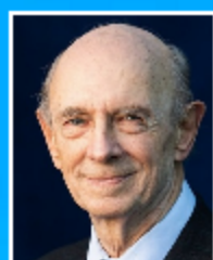
Harvey J. Alter 2020 - Medicine