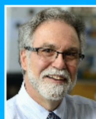
Gregg L. Semenza 2019 - Medicine